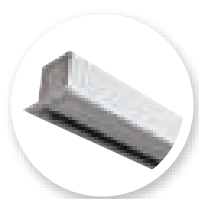
CLEAN AESTHETIC INSTALLATION