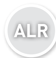
MOTORIZED PARALLAX ALR