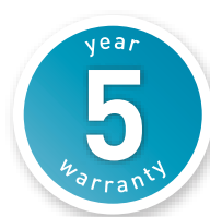
5 YEAR WARRANTY