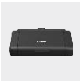
Canon MAXIFY BX110 with battery