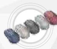
Lenovo 530 Wireless Mouse