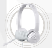
Lenovo 110 USB Stereo Headset