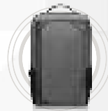
Lenovo 15.6" Laptop Urban Backpack B530