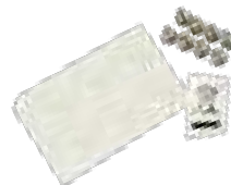
Fastening set for rackmount case