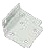
Rackmount bracket white