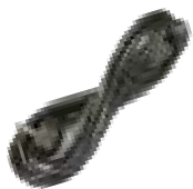
2 IEC cords