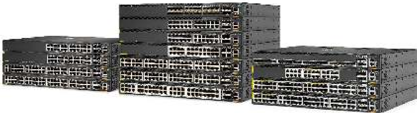
HPE Aruba Networking CX 6300 Switch Series

Dynamic Segmentation extends foundational wireless role-based policy capability to wired switches. What this means is that the same security, user experience and simplified IT management can be enjoyed throughout the network. Regardless of how users and IoT devices connect, consistent policies are enforced across wired and wireless networks, keeping traffic secure and separate.