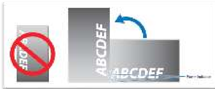
Example 1: counterclockwise

LCD displays are designed and manufactured for a standard use in vertical position. Some models can be used only in landscape and others also in portrait orientation. Please refer to product's user manual to find the correct rotation direction!