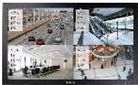
Multi-screen viewer allows all 4 signal sources being displayed in 4 screens simultaneously.

Its built-in LAN and RS232 control capabilities make the QX-Series easy to control and integration a breeze. Whether it is a local serial management connection or a remote network installation, the QX-Series can be managed in multiple scenarios and applications.