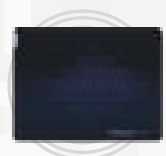
Lenovo IdeaPad Gaming Cloth Mousepad (M & L)*

* Final product may vary slightly from image.