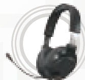
Lenovo IdeaPad Gaming H100 Headset