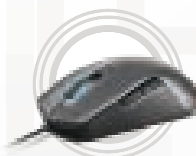
Lenovo IdeaPad Gaming M100 RGB Mouse