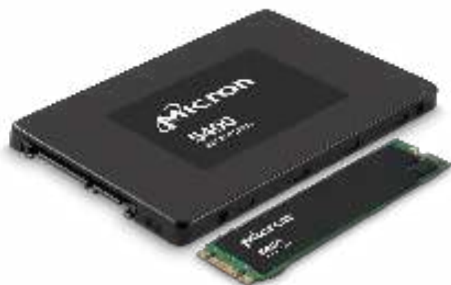
Micron 5400 SSD

Additional firmware-based security options like TCG Enterprise and TCG Opal combine with integrated, hardware-based AES 256-bit encryption for full performance plus extra security and peace of mind. 5