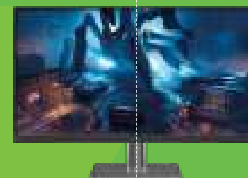
AMD FreeSync™ On AMD FreeSync™ Off

The L32p-30 is designed for those who work hard and play hard at home. Equipped with all the ports you need to connect peripherals and accessories, like full-function USB Type-C 1 with power delivery up to 75W 2 , four USB 3.0 ports, as well as HDMI and DP ports. High-quality video support along with two integrated speakers offer a comprehensive multimedia experience while the Lenovo Artery software 3 allows you to partition your display with ease for a multi-screen setup. With boundless connectivity options, the L32p-30 is truly a hub for the home office.