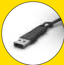
USB C and USB A connectors included