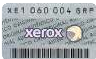
Xerox® Security Label