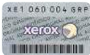
Xerox® Security Label