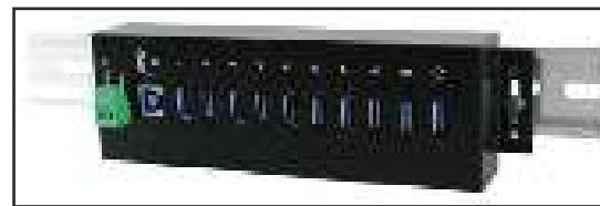
Din Rail Mounting

This manual may make reference to trademarks, registered trademarks, and other protected names and/or symbols of third-party companies not related in any way to StarTech.com. Where they occur these references are for illustrative purposes only and do not represent an endorsement of a product or service by StarTech.com, or an endorsement of the product(s) to which this manual applies by the third-party company in question. StarTech.com hereby acknowledges that all trademarks, registered trademarks, service marks, and other protected names and/or symbols contained in this manual and related documents are the property of their respective holders.