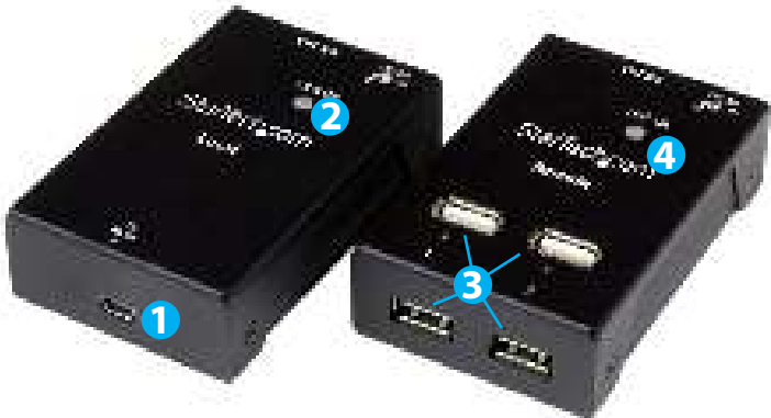
*actual product may vary from photos

The Local Extender connects to your computer using the provided Mini-USB to USB 2.0 A Cable and power is provided by your host computer. The Remote Extender provides four USB “A” ports for USB peripherals. The Remote Extender is powered using the provided Universal Power Adapter.