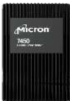
U.3: 7mm and 15mm

Designed as a mainstream solution, the 7450 SSD balances performance and density. Our offering includes a PCIe Gen4, M.2, 22 x 80mm with power-loss protection 4 and a 7.68TB E1.S that delivers industry-leading capacity. 5