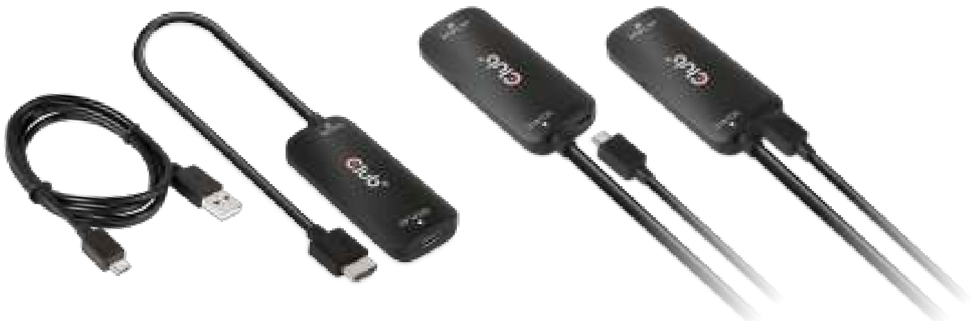
CAC-1336 + USB A to Micro USB Power Cable 1 m/3.28 ft

For optimal usages of this adapter we highly recommend you to use the CAC-1576 or CAC-1571.