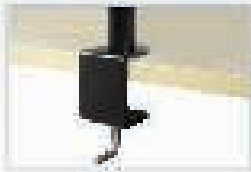
Desk Edge Mounting

Pole x 1 / Mounting Arm x 1 / Clamp x 1 / Hex Key x 2 / Cable Hook x 4 / Rubber Pad x 1 / Spacer x 8 / Cable Clip x 1 / Screw x 35 / Manual x 1